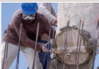
Cement, Aggregates & Concrete