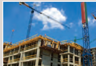
Engineering & Construction