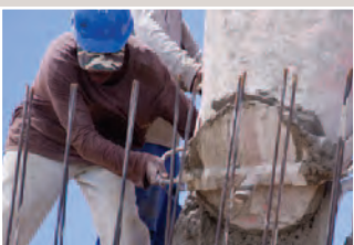
Cement, Aggregates & Concrete